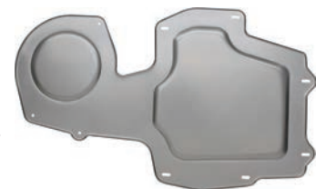
627903 Factory Air stamped firewall blockoff plate. '70-'81 Camaro