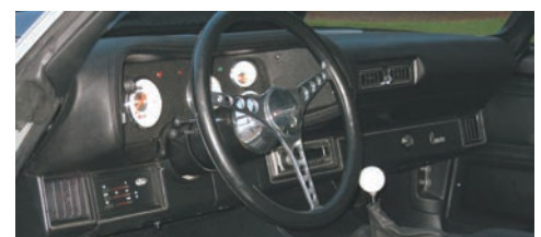
1970 Camaro factory air dash.