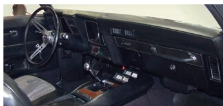
1969 Camaro factory air dash.