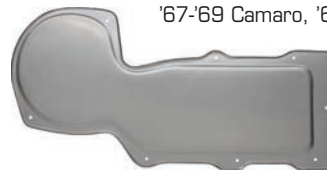
627902 Non-Air stamped firewall blockoff plate. '67-'69 Camaro, '64-'72 Chevelle & '68-'74 Nova

Note: Fits '70-'81 Camaro with minor firewall flange modifications.