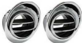
49306-VCL 1967/68 outside Astro vent (pair)