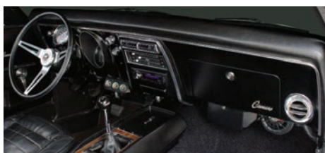
1967-68 Camaro factory air dash.