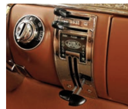
'55-'56 control panel