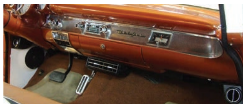
1957 Chevy installation with center plenum.

We offer new direct replacement radiator shrouds for classic Chevs. We also recommend using our heavy-duty fan blade.