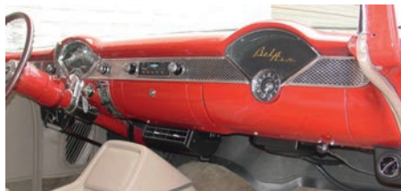
1955-56 Chevy installation with center plenum.