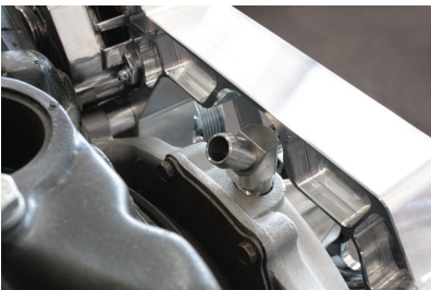
OEM-Style Water Pump Bypass Design