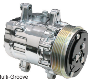
Multi-Groove Polished Finish

046704 Double V-groove pulley, chrome finish