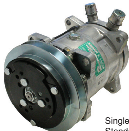
Single V-Belt Standard Finish

04808-SWQ Single wide-groove pulley, polished finish (3/4" Belt)