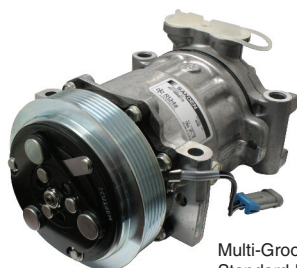
Multi-Groove Standard Finish

You must use a 3/4" wide belt for proper belt contact and grip.